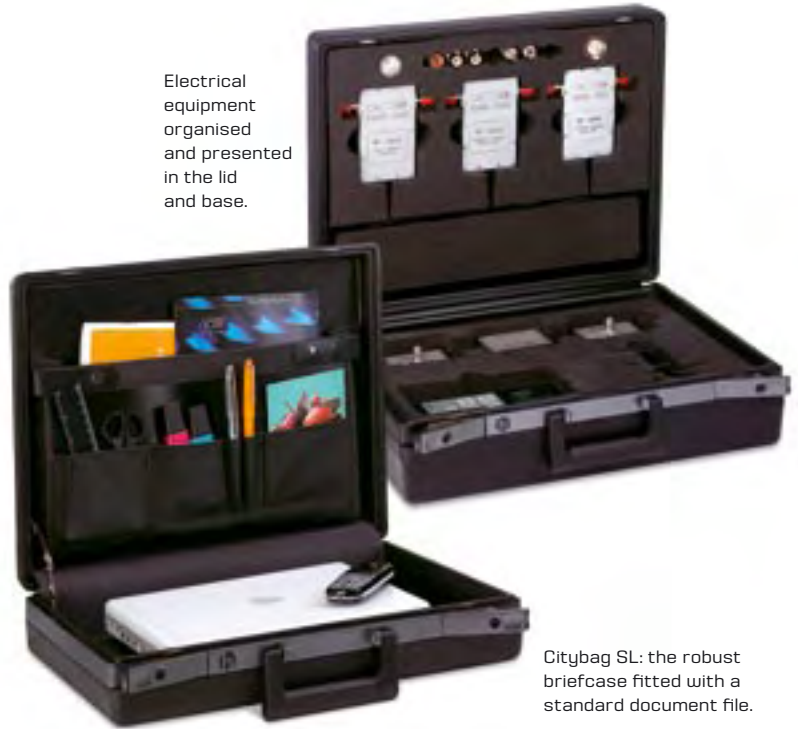
Citybag SL: the robust briefcase fitted with a standard document file.

Electrical equipment organised and presented in the lid and base.